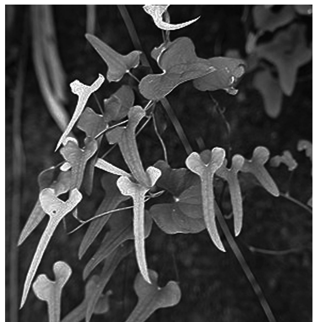
Fig. 3. Dioscorea polystachya Turcz., foliage, extant, Taiwan

Dioscoreaceae. Convergent leaf morphology is exemplified by the living Smilax auriculata Walter, distributed in the USA (Florida, Georgia, North and South Carolina, Alabama, Mississippi, Louisiana); it is an evergreen climbing vine which grows on coastal sand dunes and on insolated sites in sandy woodland. It is similar in the form of the lamina to Dioscorea but differs mainly in its sub-coriaceous evergreen foliage.